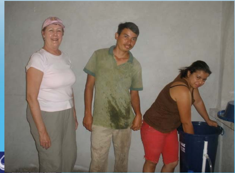
SLOW SAND WATER FILTER